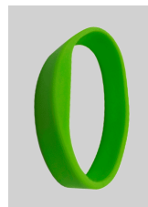
Silicone Wristband NXP MIFARE®