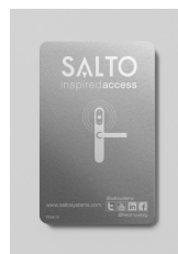
Key Card NXP MIFARE® HID®