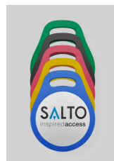
Key Fob NXP MIFARE®