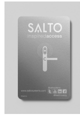
Key Card NXP MIFARE®