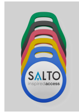
Key Fob NXP MIFARE®